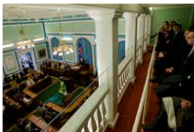
The public gallery is open when Althingi is sitting, providing an opportunity to observe parliamentary business.

The Constitution of the Republic of Iceland is based on the principle that power originates with the people, who assign that power to their elected representatives. This system is termed representative democracy. Every fourth year the electors choose, by secret ballot, 63 representatives to sit in parliament. These Members of Althingi jointly hold legislative powers, and also fiscal powers, i.e. the power to make decisions on public spending and taxation. It is important that the people should know what decisions are made in parliament, and how they are made, as the electorate and their representatives are responsible for maintaining democracy in action. The right to vote may be said to be the basis of democracy in Iceland, and Althingi is its cornerstone.