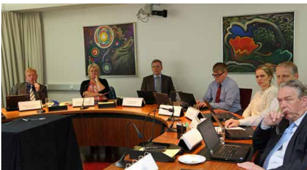
Standing committees are elected at the first parliamentary session of Althingi after a general election. Nine members hold seats in each committee. Meeting of the Industrial Affairs Committee.