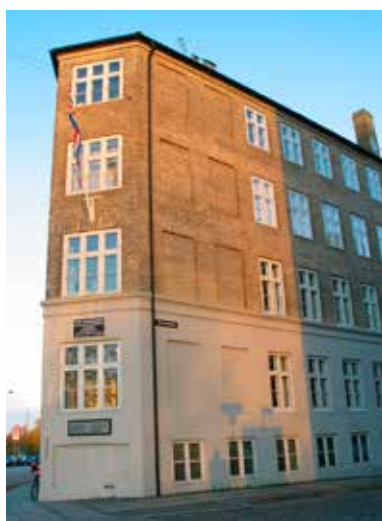
Jónshús (Jón Sigurdsson House) on Øster-Voldgade, Copenhagen.

A Jón Sigurdsson Memorial Day has been an annual event since 2008 at the Jón Sigurdsson House on the First Day of Summer (according to Icelandic tradition). The object of the Memorial Day is to honour the memory of Jón Sigurdsson and ensure that his deeds and ideals are not forgotten. It is organised by the board of the House, with the cooperation of the Speaker and the Presidium. The Jón Sigurdsson Prize is awarded at the Memorial Day, commemorating his service to Iceland and the Icelanders. The prize is awarded for achievements relating to the ideals and work of Jón Sigurdsson, whether in the field of scholarship, business, education or culture.