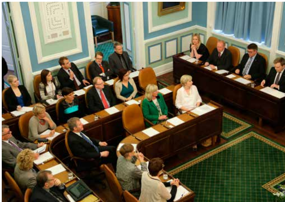
After the general election of 2013, six parties are represented in Althingi: Bright Future, Left Green Movement, Independence Party, Pirate Party, Progressive Party and Social Democratic Alliance.