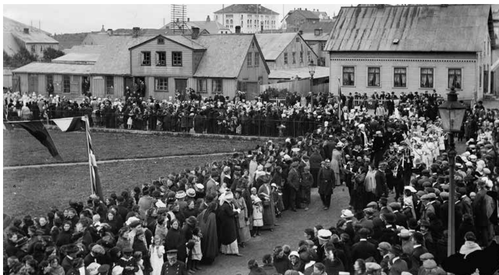
Women celebrate their enfranchisement on Austurvöllur square at the opening of parliament on 7 July 1915. The first woman Member was elected to Althingi in 1922. In the general election of 2013, 25 women were elected, making up 39.7% of Members.

implemented in 1916: almost all males aged 25 years or older were enfranchised, as were women aged 40 and older. The laws also stated for the first time that a voter must have been born in Iceland, or have lived in the country for five years. Royal nomination of Members was abolished, and a system of nationally-elected Members was introduced. In the election of national Members all males aged 35 and over, and women 40 and over, were eligible to vote. Nationally-elected Members were elected for a term of 12 years, but three were to stand down after six years. Election of national Members was abolished in 1934. In 1920 women gained equal voting rights with men; all Icelanders were now eligible to vote from the age of 25, except those who had received support from public funds. The number of Members of Althingi was raised to 42 by the addition of two more Members for Reykjavík (totalling four), where nearly 20% of the population now lived. Minor changes took place in constituencies and electoral legislation in the following decades, and the number of Members rose to 52. Under the Constitution Act of 1934 the last economic barriers to voting rights were abolished, and the voting age was lowered to 21 years. Nearly 60% of the population were now eligible to vote, and participation in elections was about 80%. Before the general election of 1968 the voting age was lowered to 20 years, and in 1987 to 18 years.