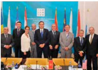
Presidents of parliaments of small European nations with a population of under one million met in Montenegro in september 2012.

At the first sitting of each parliament, Members are elected to the delegations. Three to seven delegates are elected, and an equal number of substitutes. The function of delegations varies according to the position and nature of the international organisations of parliamentarians to which Althingi is a party. Some international organisations of parliamentarians function alongside a council of Ministers, which is a forum of cooperation between governments. In such cases the parliamentarians' organisation has a formal status, and rights and responsibilities vis-à-vis the council of Ministers, to which it submits proposals and resolutions. Other parliamentarians' organisations cooperate informally with governments or international agencies. The delegations of Althingi attend meetings and conferences of international parliamentarians' organisations, as representatives of Althingi. Delegates use such opportunities to put the Icelandic point of view, as appropriate. International parliamentarians' organisations prepare reports and pass resolutions and proposals which are submitted to governments or international agencies. Parliamentarians' organisations are also a forum for Members of national parliaments to exchange views and information. The Icelandic delegations also organise meetings and conferences of parliamentarians' organisations in Iceland.