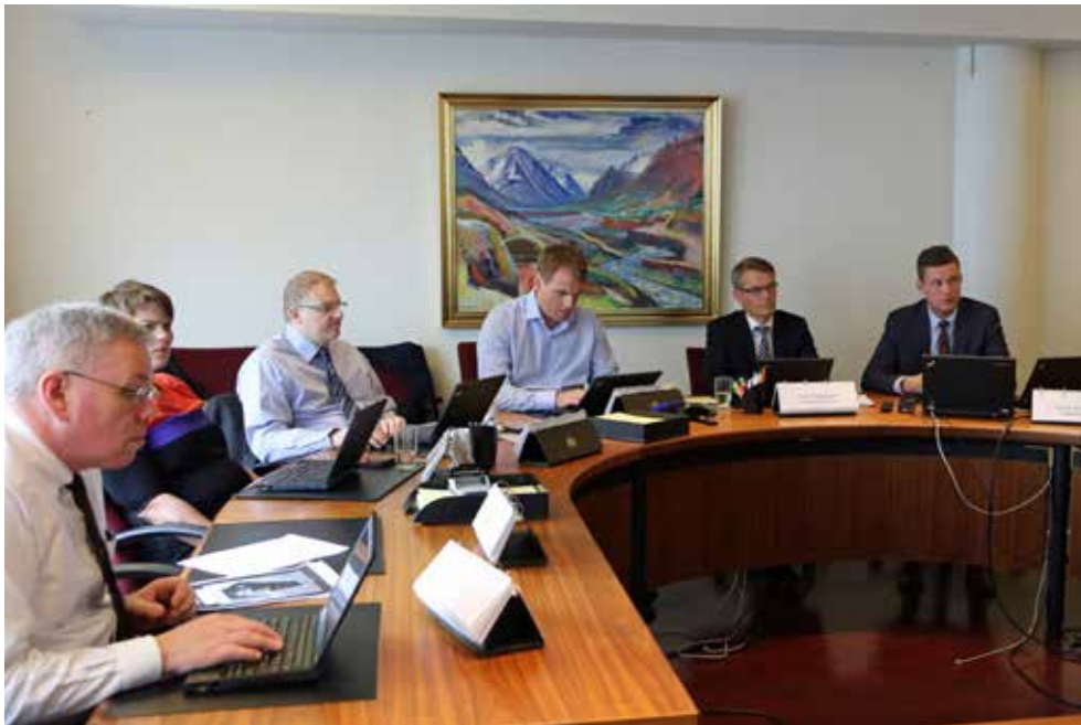
Committee Members may decide to submit a Bill on behalf of the committee in fields under its aegis. Meeting of the Economic Affairs and Trade Committee.