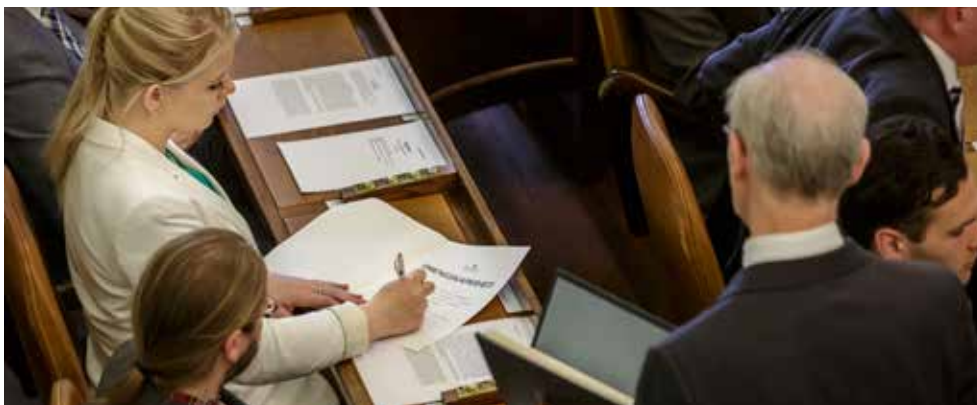
Members of Althingi swear an oath of loyalty to the Constitution when they take their place in the House for the first time.

You can write to Members of Parliament on important issues. Their e-mail addresses are listed on www.althingi.is Postal address: Althingi, 150 Reykjavík. You can telephone Members of Parliament to put your point of view. Tel.: (354) 563 0500.