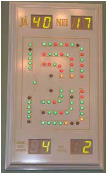
Members vote by pressing one of three buttons on their desks. An illuminated board in the chamber displays the results of the vote, and how each Member voted.

When difficulties arise in Icelandic society, people often remark that it is high time Althingi intervened in the matter. This is evident from blogs, readers' letters and editorials in the press, radio and television interviews, discussions in the hot tubs of swimming pools, and at the dinner tables of the nation's homes. It is, however, up to the politicians to decide whether legislation is the proper response to the difficulties at hand.