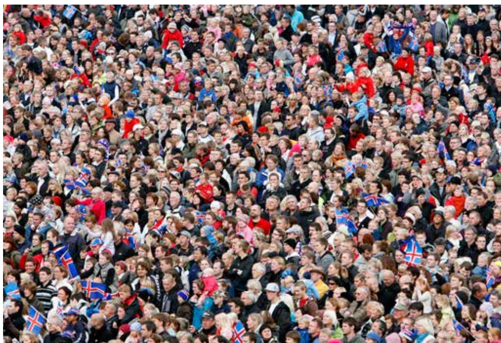
At the general election of April 2013, 81.5% of the electorate voted.

The constituency boundaries are decided by law; however, the national electoral committee may be authorised to draw the boundaries in Reykjavík and the vicinity. Following each election to Althingi, if the number of registered voters represented by each parliamentary seat, including equalisation seats, in any constituency is less than half that of those in another constituency, the national electoral committee must adjust the number of parliamentary seats in the constituencies to reduce this difference. This provision was applied in 2003, when the national electoral committee determined that one constituency seat should be transferred from the Northwest constituency to the Southwest for the following election in 2007. Numbers of constituency seats were again revised after the general election of 2009: the Southwest consistency now has eleven seats, the Northwest seven, and the others nine. Alterations to constituency boundaries and arrangements for allocation of parliamentary seats determined by law require a two-thirds majority in Althingi. The first general election under this consistency system was in 2003. Prior to that time Iceland had comprised eight constituencies, under legislation from 1959.