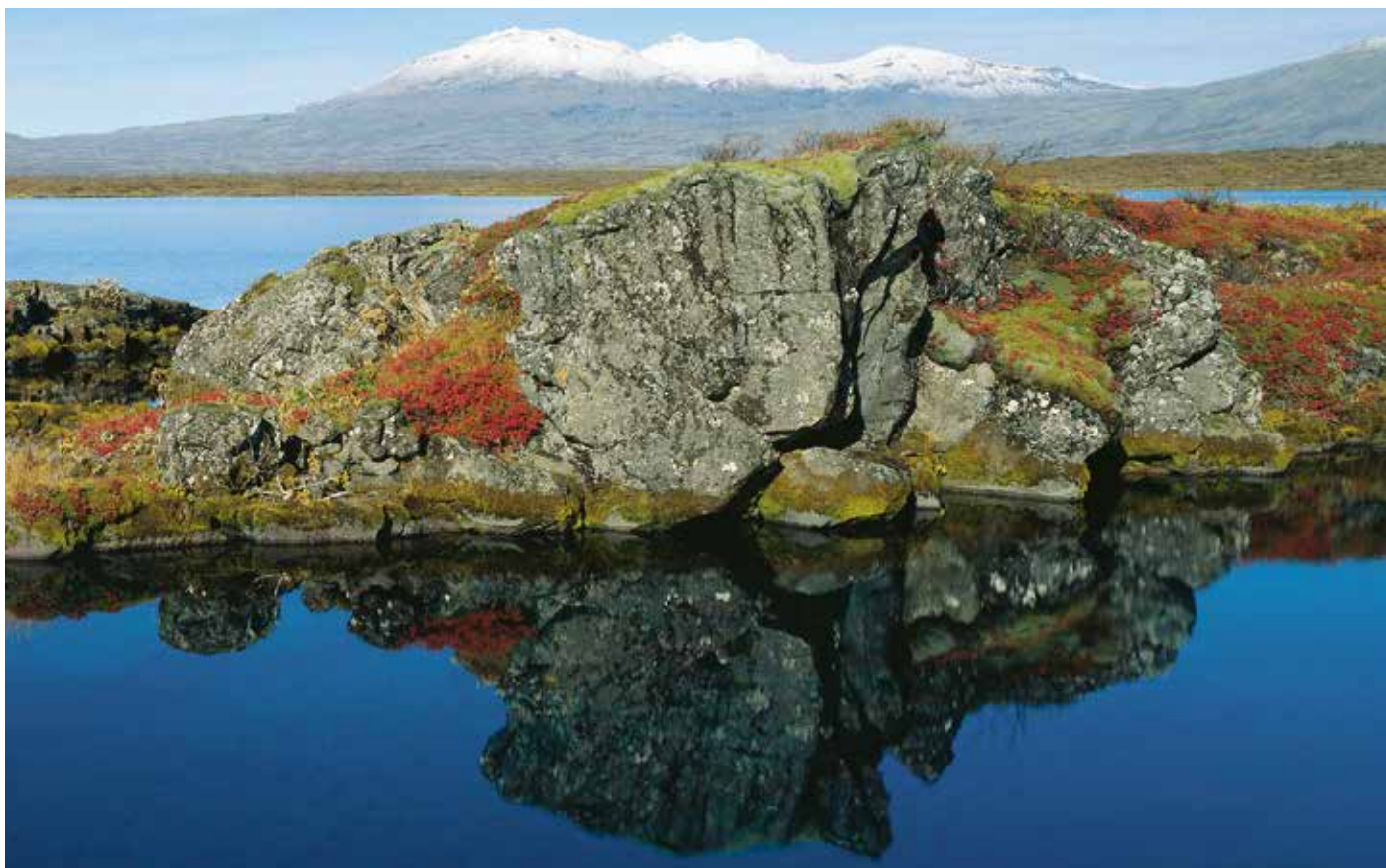
Icelandic history and nature come together at Thingvellir, which provides a unique view of geological history, along with a remarkable natural environment. The foundation of Althingi (parliament) at Thingvellir in AD 930 marked the beginning of the old Icelandic Commonwealth. Althingi continued to meet at Thingvellir until 1798.

Decisions made in parliament have an impact upon the daily lives of all Icelanders. The aim of publishing this information booklet on Althingi is to explain parliament's organisation, work and history. The booklet should be helpful to all who want to know more about Althingi.