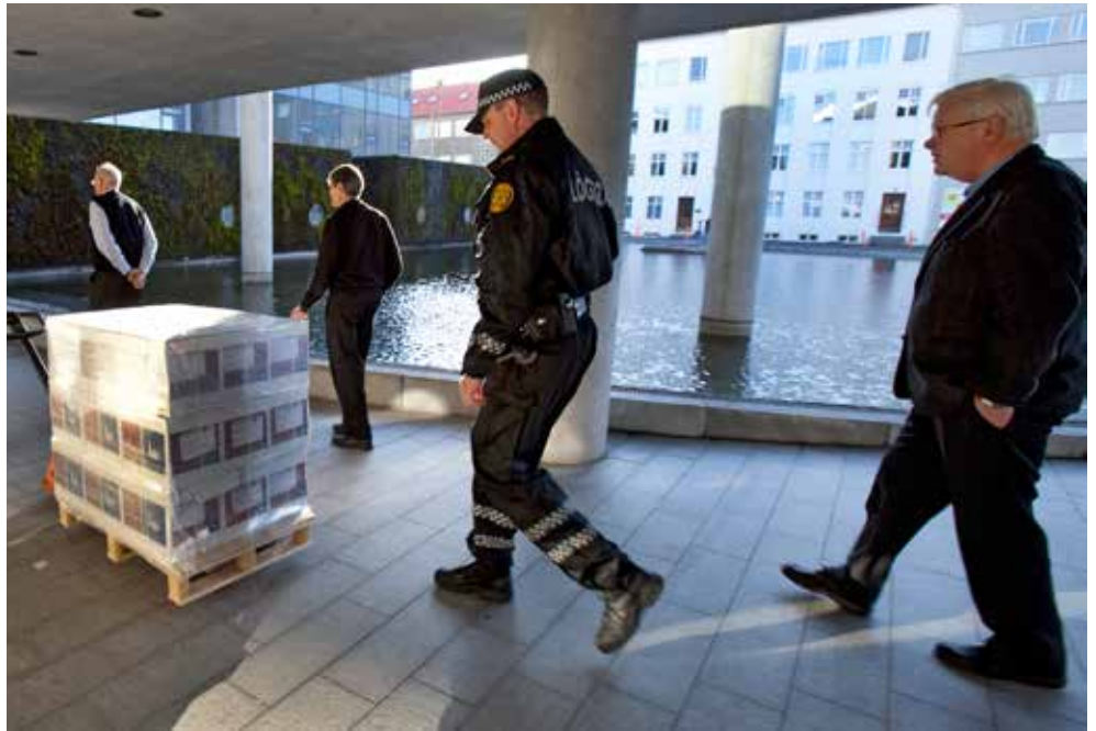
Ballot papers are transported by the police from the printer to polling stations.

At a general election, political parties seek the nation's mandate to take responsibility for both legislative and executive powers. Iceland has a strong tradition of coalition government, while the parliamentary Opposition serves as a check upon the Government.