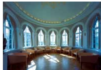
The Rotunda was added to Parliament House in 1908.