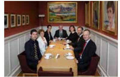
The Speaker cooperates with the chairmen of the party groups in planning the agenda of the assembly and the organisation of debates.

The public sometimes comment that only a few Members are present at debates. There are various reasons for this. Members of each party tend to divide their responsibilities, specialising in certain fields.