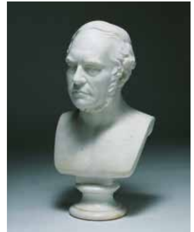
Jón Sigurdsson (1811-79) was the leader of the Icelanders' campaign for independence in its first phase. His work yielded fruit in the first constitution, issued in 1874. His memory was honoured by the Icelanders when they chose his birthday, 17 June, to found the modern republic in 1944. Since then it has been Iceland's National Day.

Public demand for influence on government increased throughout the course of the 19th century, as nationalist consciousness intensified. The response of the Danish king,