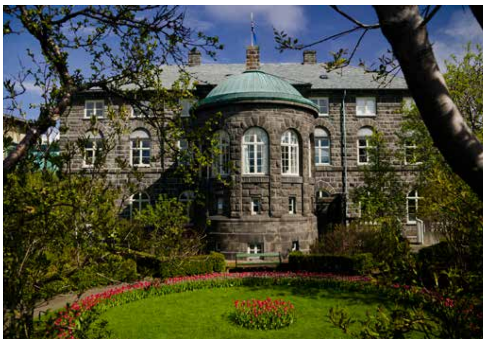
South view of Parliament House and the garden.